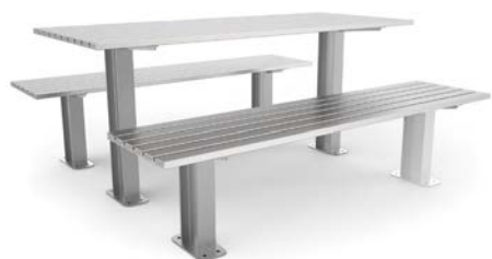
Ion Table Setting | Code TBL009 L1800 x W750 x H775mm

Frame & Battens Options: See table on page 11