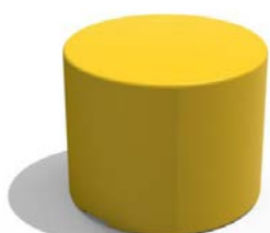
HopOp500 | Code #157 Ø500 x H400mm