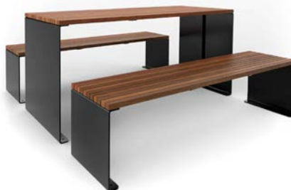
Wharf Table Setting | Code TBL107 Table: L1800 x W805 x H810mm Benches: L1800 x W490 x H450mm

Frame & Battens Options: See table on page 11