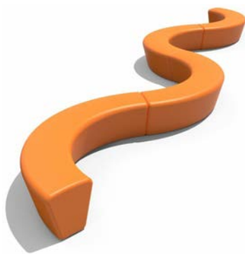
LOOP Arc | Code #137 One module: R1350 x H400mm Width (cross section): 400mm