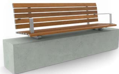
Ion Plinth Mounted Seat | Code SEAT011 L1800 x W573mm

Frame & Battens Options: See table on page 11