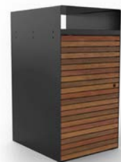
Wharf Bin | Code LTR107 120/140L, 240L

Frame & Battens Options: See table on page 11