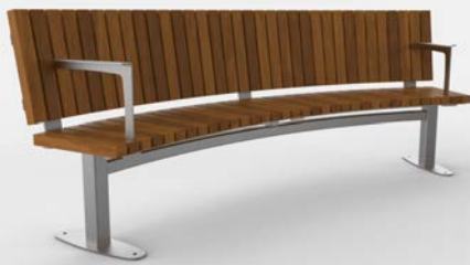
Benches & Seats