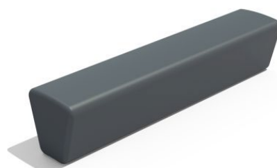
LOOP Line | Code #140 L2000 x H400mm