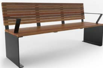
Wharf Seat | Code SEAT107 L1800 x W490 x H860mm

Frame & Battens Options: See table on page 11