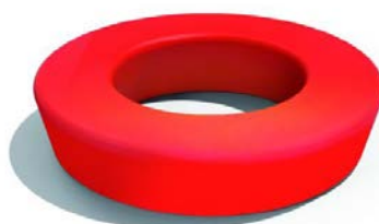
LOOP Circle Light | Code #136 Ø1800 (outside) x H400mm. Ø1000 (inside)