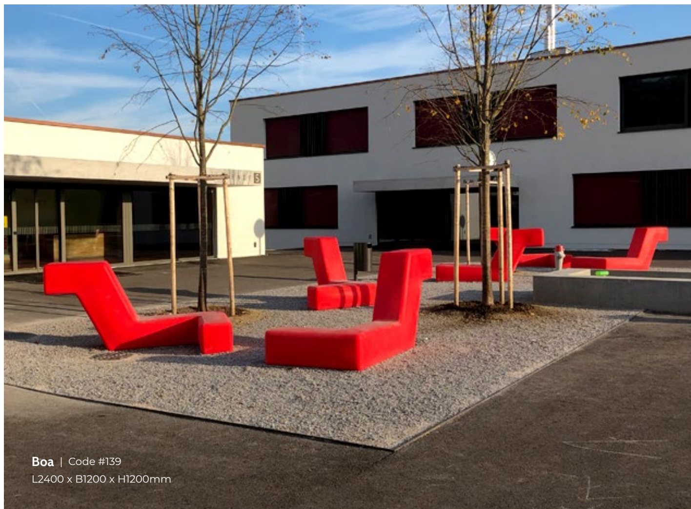
Boa | Code #139 L2400 x B1200 x H1200mm