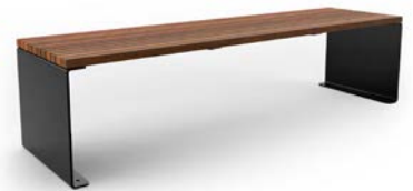
Wharf Bench | Code BCH107 L1800 x W490 x H450mm

Frame & Battens Options: See table on page 11