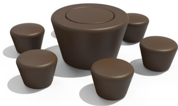
LOOP Picnic Up | Code #201 Loop Cone: T Ø1130 x B Ø810 x H700mm HopOp500: Ø540 x H400mm