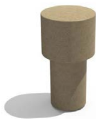
HopOp | Code #141 Ø350 + Ø500 x H950mm