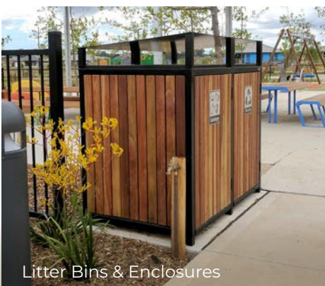
Litter Bins & Enclosures