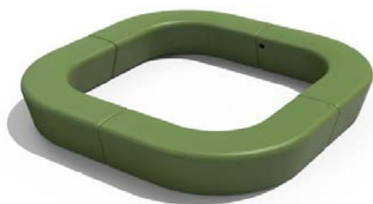
LOOP Corner | Code #187 One module: L1400 x B1400 x H400mm Width (cross section): 400mm