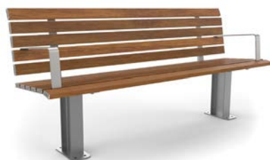
Ion Seat | Code SEAT010 L1800 x W573 x H837mm

Frame & Battens Options: See table on page 11