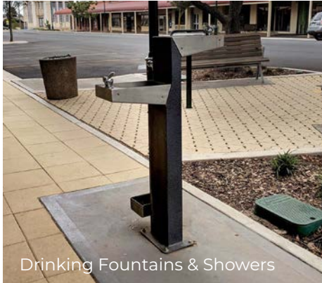
Drinking Fountains & Showers