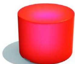
HopOp500 Light | Code #187 Ø500 x H400mm