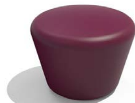
LOOP Up | Code #198 Ø540 x H400mm