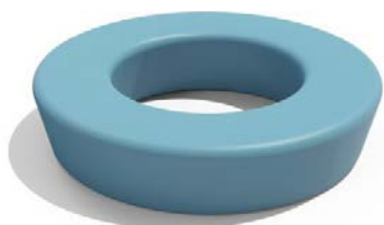
LOOP Circle | Code #135 Ø1800 (outside) x H400mm. Ø1000 (inside)