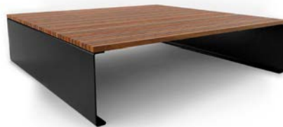
Wharf Platform | Code PLT107 L1800 x W1800 x H450mm

Frame & Battens Options: See table on page 11