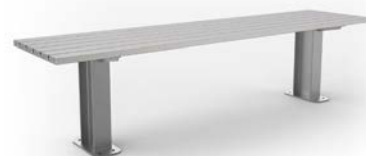
Ion Bench | Code BCH009 L1800 x W445 x H450mm

Frame & Battens Options: See table on page 11