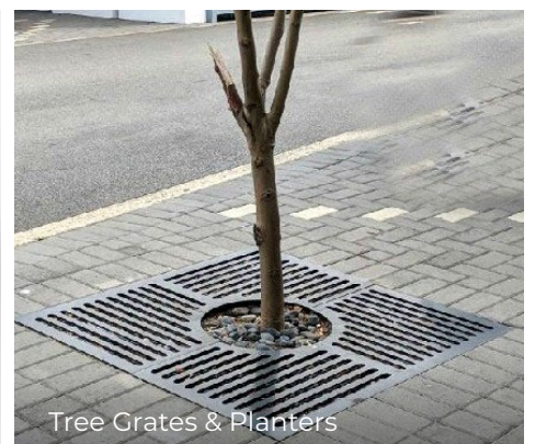
Tree Grates & Planters