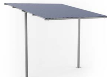
Ion Shelter | Code SHL001 2000 x 3000mm 4000 x 4000mm 4000 x 8000mm

Frame & Battens Options: See table on page 11