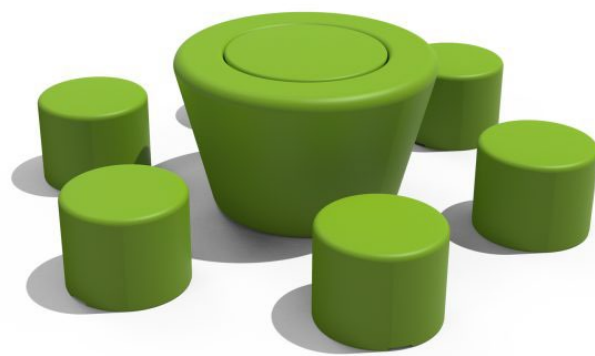
LOOP Picnic H.500 | Code #172 Loop Cone: T Ø1130 x B Ø810 x H700mm HopOp500: Ø500 x H400mm